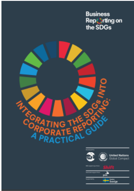
Integrating the SDGs into Corporate Reporting: A Practical Guide